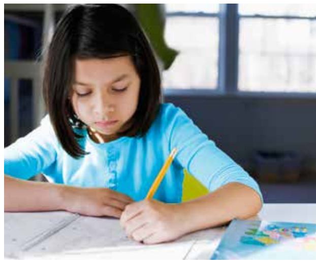
Teachers report their students from immigrant families are anxious about a wall between the U.S. and Mexico and fearful they will be deported.